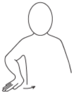
Garden = Farm

Always remember to say the word as you sign.